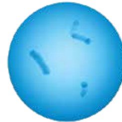
CLARION 25 AND ARENA 300 WITH MICROBAN