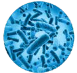
COMPETITIVE FLOOR FINISH

*Images shown are simulations representative of typical bioburden counts on treated and untreated surfaces.