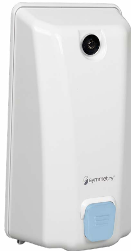
99014601 White with Empathy Light Blue Lever