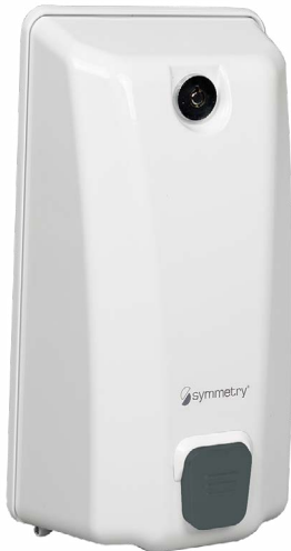
99014501 White with Alpine Gray Lever