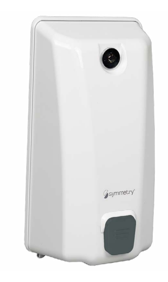
99014501 White with Alpine Gray Lever