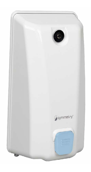
99014601 White with Empathy Light Blue Lever