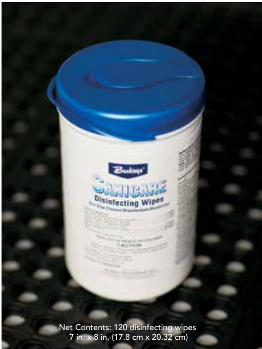
Net Contents: 120 disinfecting wipes 7 in. x 8 in. (17.8 cm x 20.32 cm)

ONE-STEP CLEANER/DISINFECTANT/DEODORANT/SANITIZER