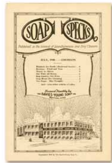
Monthly newsletter published by The Davies-Young Soap Company, July 1930

FOUNDED in 1844, Buckeye International, Inc. has earned its reputation as a leader in the cleaning and maintenance industry through its standards of quality, integrity, and innovation.