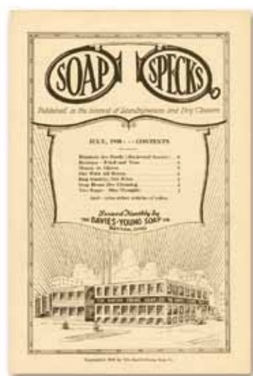
Monthly newsletter published by The Davies-Young Soap Company, July 1930

FOUNDED in 1844, Buckeye International, Inc. has earned its reputation as a leader in the cleaning and maintenance industry through its standards of quality, integrity, and innovation.